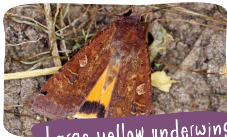
Large yellow underwing